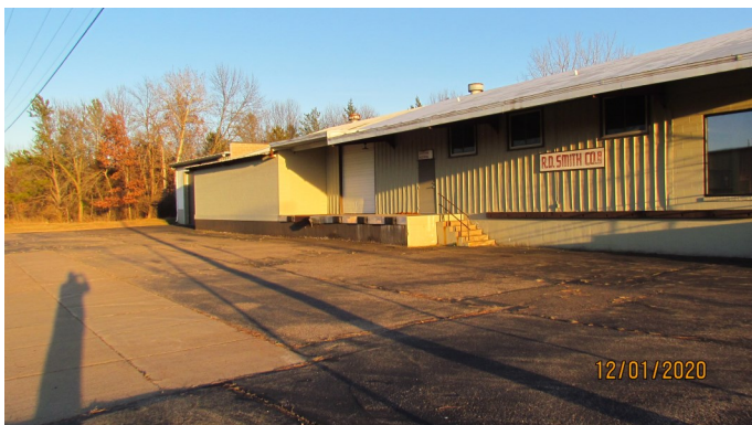
NORTHSIDE OF BLDG.