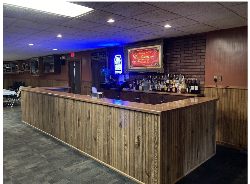
Second bar in banquet area