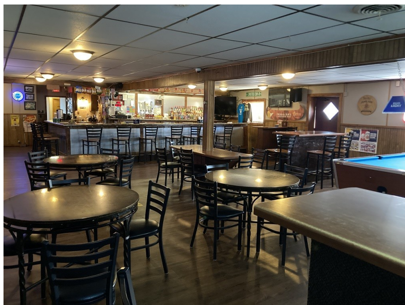
Main bar area