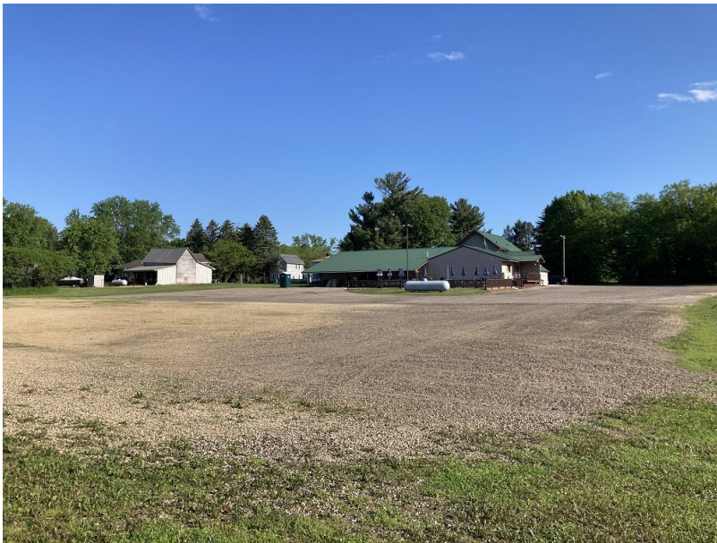
Large parking lot